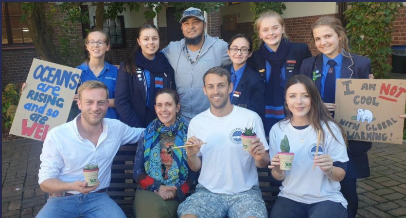
The Earth Children environmental society held an assembly focusing on climate change, and especially the plight of our oceans. Guest speakers from Cape Research and Diver Development and Sea the Bigger Picture addressed the learners, and much was learnt by all. Some of the learners also showed off their climate change posters, created for a global climate change march last term.