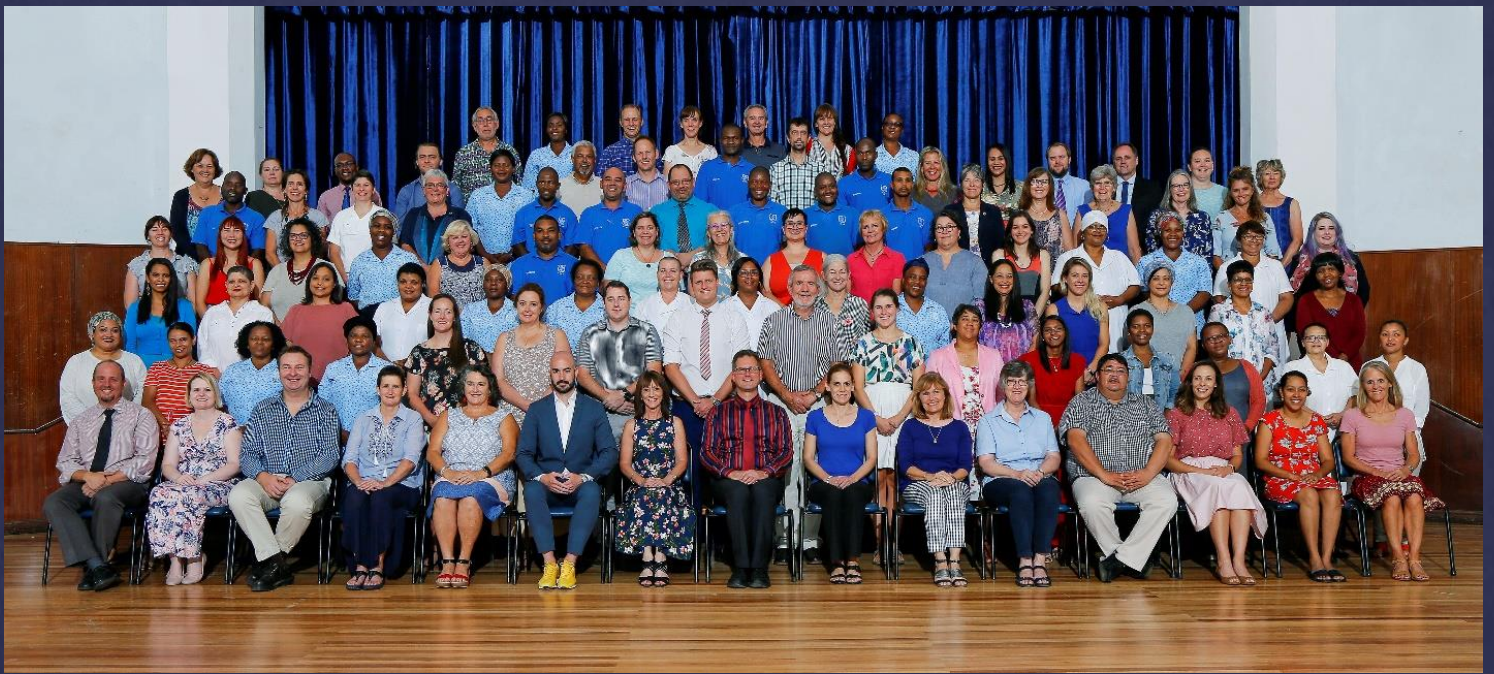
Rustenburg Girls' High School has over 100 staff members. Once a year everyone gets together for a full staff photograph.