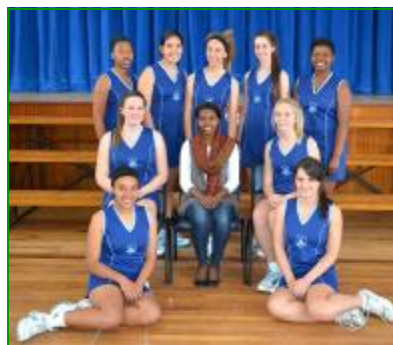
Pictured left: the RGHS First Netball Team

Overall goal averages: Rustenburg placed 3rd behind Wynberg and winners Herschel.