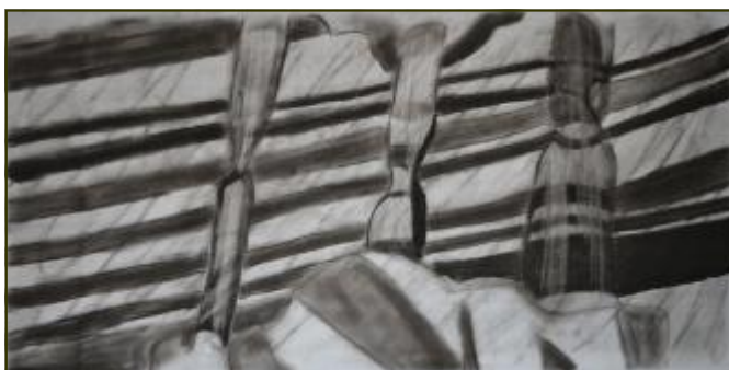
Mineschke Botha, D5