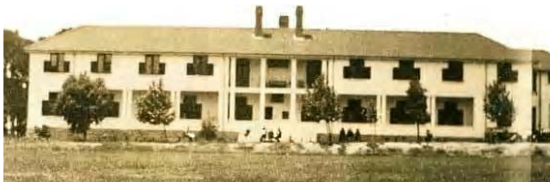
The original Erinville building

Orders can be submitted by email to vandykp@rghs.org.za or by fax to 0216857559.