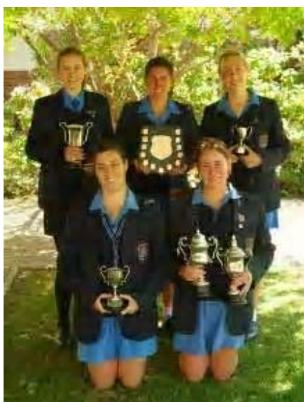
Sports Awards Winners 2010

Sunday 7 November 2010 Landmarks 6km Fun Run (Start at WPCC)