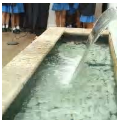
Rustenburg's new water feature