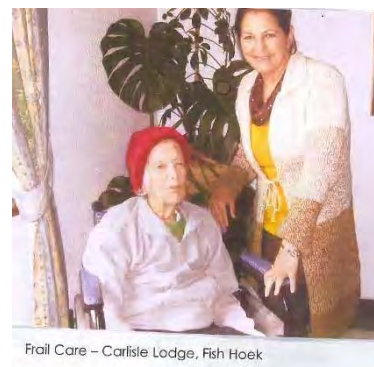
Frail Care – Carlisle Lodge, Fish Hoek