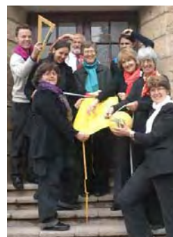
Fun with the Maths Department