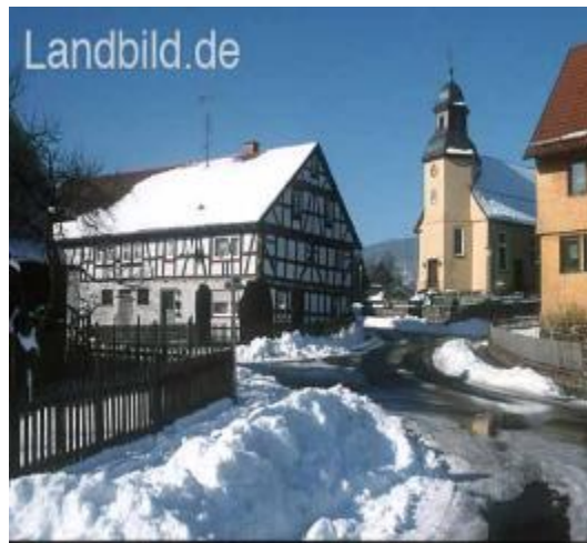
Lanzenhain (Herbstein)